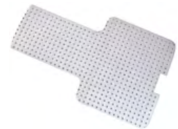
Perforated Base Plate