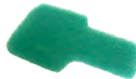
Drainage Mesh Pad